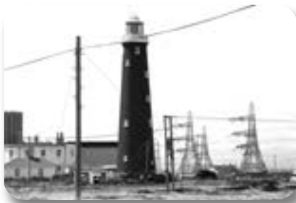
Jacob T captured the old light house at Dungeness.

All the students enjoyed their day and commented on how much they enjoyed the exhibitions.