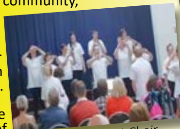
The Fifth Trust Choir in full voice

On Saturday 27th July our newly formed choir performed as a guest choir with The Reach Out Gospel Choir at Barham Village Hall, along with 2 other guest choirs.