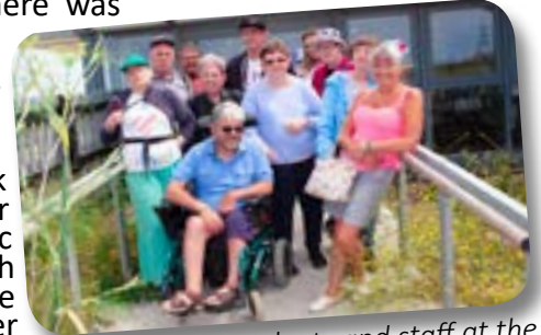
Photography students and staff at the End Of The Line Café, Dungeness.

Miller's work uses a number of photographic techniques, which our students are learning in their sessions.