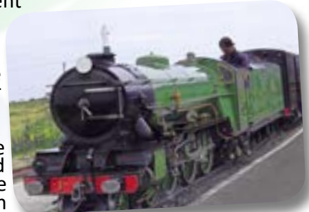
Michael B enjoyed photographing a light railway steam engine.

After lunch we were able to spend some time at Dungeness. We went for a short walk around the estate and the students used the time to practise their photography skills.