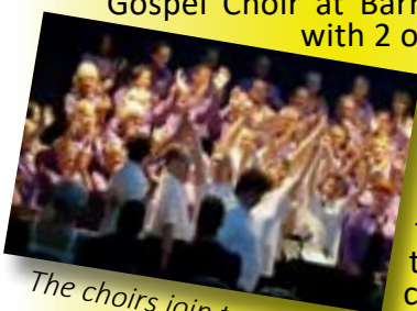
The choirs join together for the grand finale