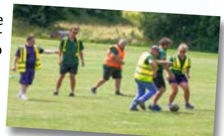
Students and staff enjoying a game of football.

We are all looking forward to next year and doing it all again.